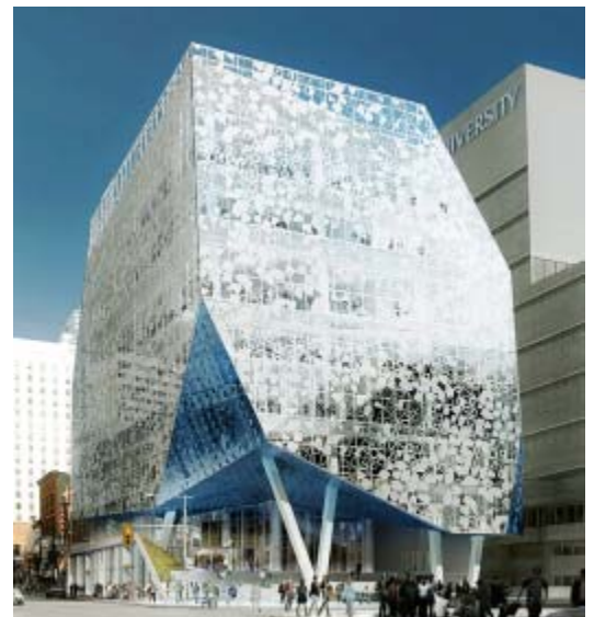
Exterior, Student Learning Centre

Parking: please visit this website (the OAS does not guarantee its accuracy): https://en.parkopedia.ca/parking/ryerson_university/?arriving=201709221430&leaving=201709221630