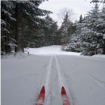
Fig. 2.

catching up on social or archaeological news.